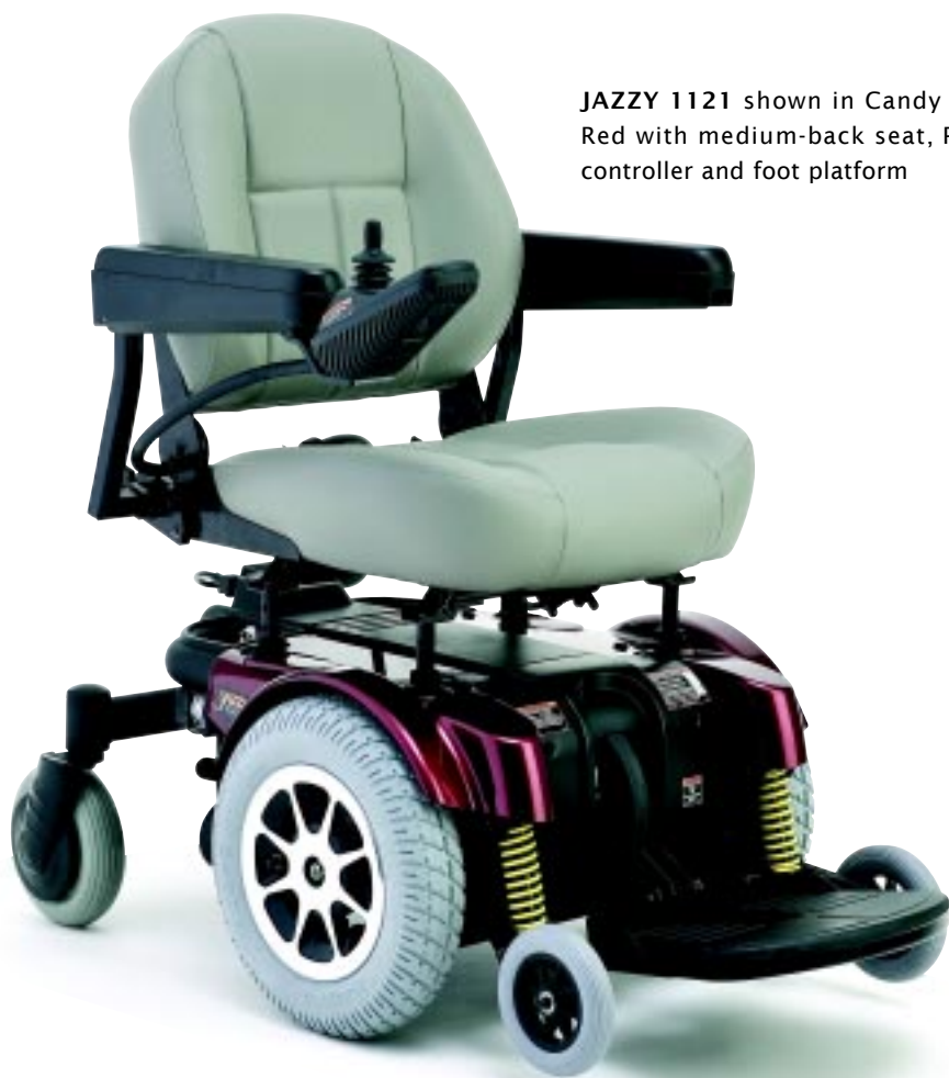
JAZZY 1121 shown in Candy Apple Red with medium-back seat, PG VSI controller and foot platform

Tight-space indoor maneuverability is made easy with the Jazzy 1121's compact overall size and mid-wheel drive design. Yet, the 1121 doesn't stop there. Outdoor performance—climbing and terrain transitions—is ensured through the use of Active-Trac ® Suspension and the responsive action of the front anti-tips and rear casters. The Jazzy 1121 is the perfect power chair for your diverse and demanding lifestyle.